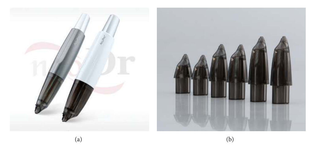
FIGURE 2: AcuPro and stainless steel fine needles used in this study.