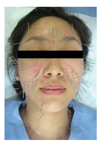
FIGURE 1: Facial cosmetic acupuncture applied in this study.

Clinical Practice guidelines and the revised version of the Declaration of Helsinki. The trial protocol was approved by the Institutional Review Board of Kyung Hee University Hospital at Gangdong (KHNMC-OH-IRB 2011-007). Written informed consent was obtained from all participants prior to enrollment, and participants were given ample time to decide about participating before signing the consent form.